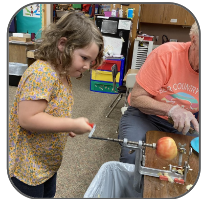
Hands-on learning - carving apples to make applesauce