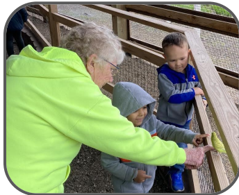
Preschool field trip to Hemker's Zoo